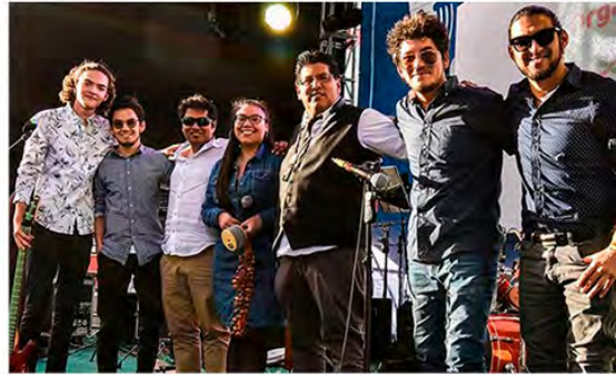
• Concierto en el Festival gastronómico FESTISABORES 2019 •