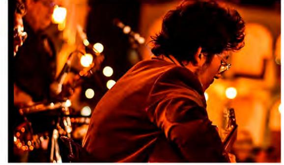
• Festival Sonamos Latinoamerica Arequipa, 2019 •