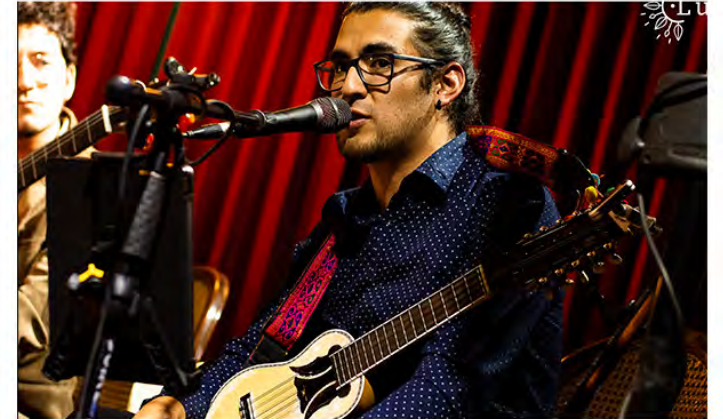
• Sonqollay •