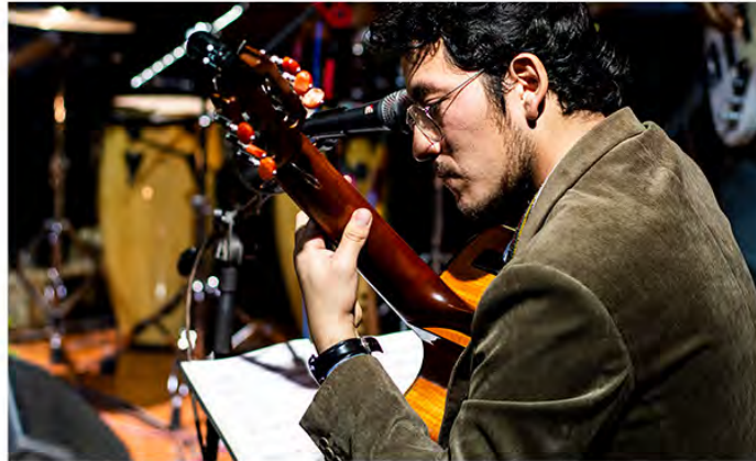
• Negra presuntuosa •