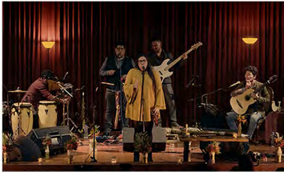
• Concierto de presentación del EP Introversiones 2019 •