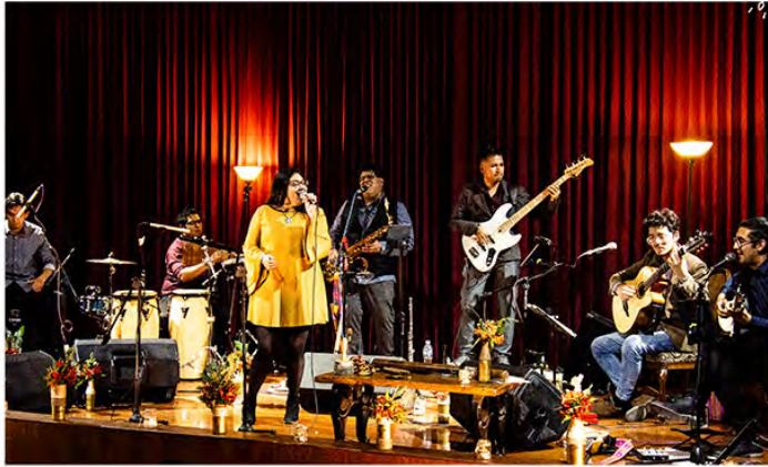
• Coplas de amor y tondero •