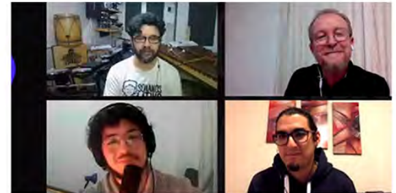
1er Festival Internacional de Música Popular Sonamos Latinoamérica virtual lase