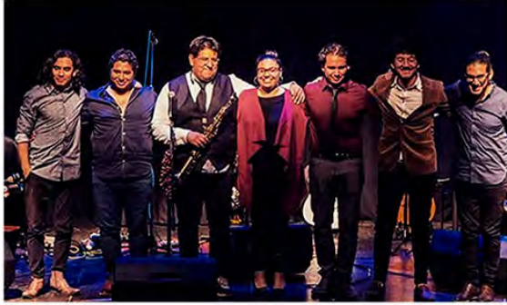
• Festival Sonamos Latinoamerica Argentina 2018 •

Santa Fé • Rosario • Lincoln • Paraná • Pergamino