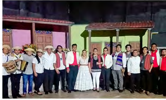
• Festival del Almojábano Panamá 2018 •

Santa Fé • Rosario • Lincoln • Paraná • Pergamino